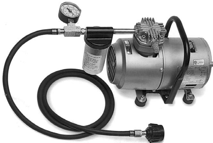
Figure 3 New Cylinder Air Purging Pump

After air in the new cylinder has been evacuated according to the manufacturer's instructions, momentarily charge the cylinder with vapor before filling the cylinder with liquid.