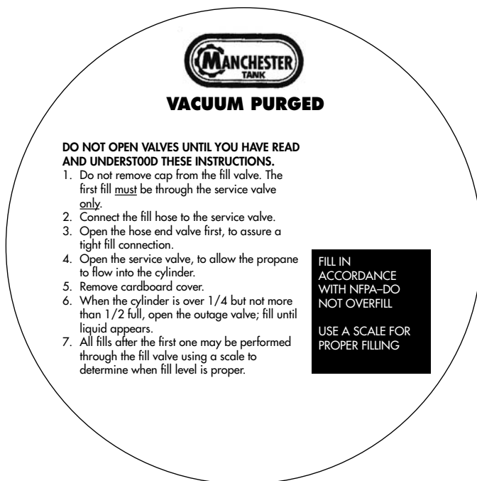
Figure 2 Sample Vacuum Purge Label